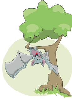
hang from a tree