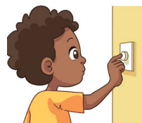
ring the bell